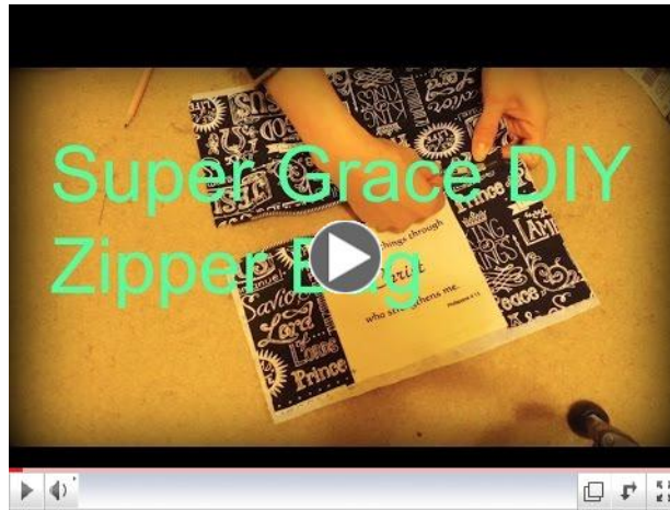
Super Grace DIY Zipper Pouch from Grace & Joy Arts