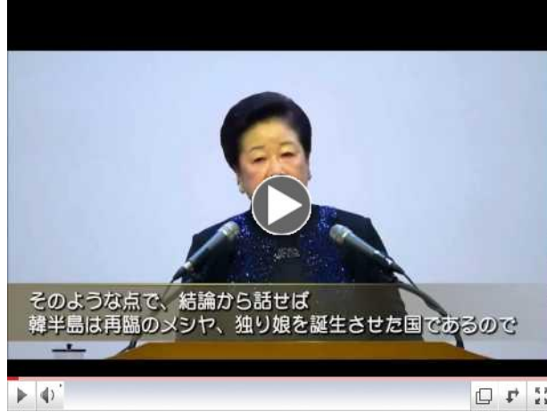
2015 Cheongpyeong Autumn Great Works (10/24/2015)

To summarize, there are four references to how all of Christian and Korean history was to produce the "Only Begotten Daughter," and just one reference to True Father, who was fortunate to have a rare flower growing near his grave.