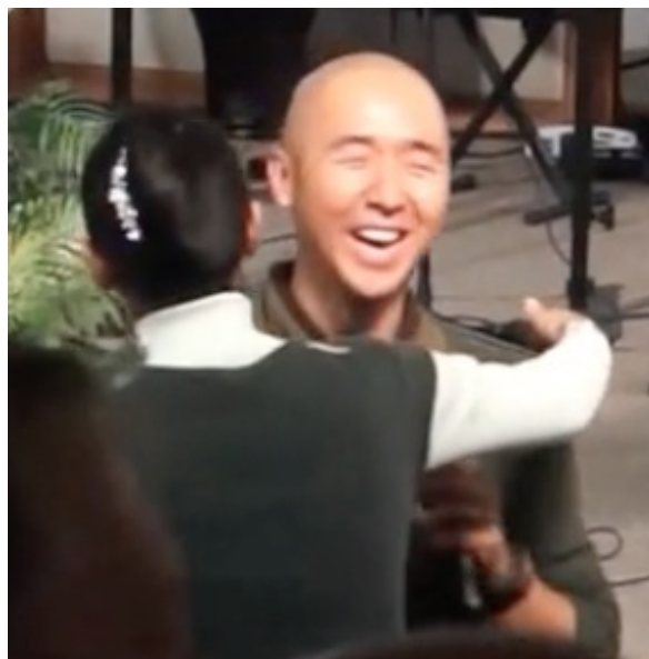
"The Eternal Kingdom" Sermon, 10/18/2015