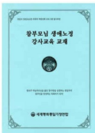
The "non-existent," "un-official" manual

Since this error was printed in the non-existent/un-official Korean manual, surely the Family Federation will be releasing a public statement very soon clarifying that this was a regrettable mistake and heresy for Eve to be appearing in the subject position. I'm sure that the Japanese FFWPU will be happy to issue a similar statement regarding the non-existent Japanese manual as well that "Eve appearing in the subject position would be a grave mistake and heresy."