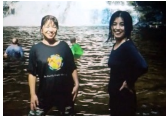
Unification Sanctuarians at Waterfalls