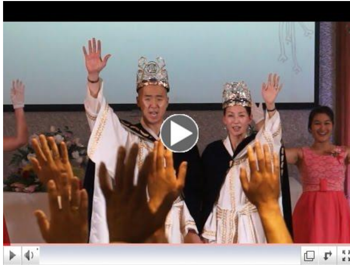
Holy Blessing Ceremony to Restore True Father's Authority, 8/30/2015 Part Two