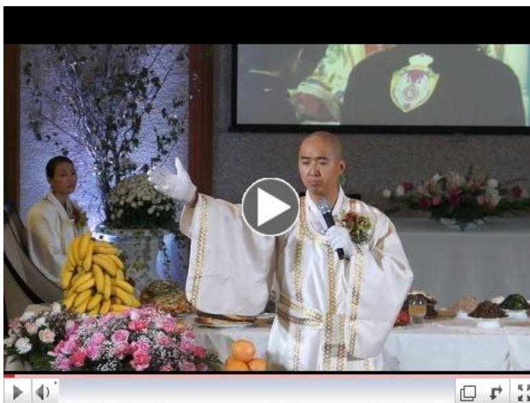
3rd Memorial of True Father's Seonghwa at Unification Sanctuary 8-30-2015- Part One

Four hundred and thirty five brothers and sisters gathered at the World Peace and Unification Sanctuary in Newfoundland, PA on Sunday to honor the third anniversary of True Father's Seonghwa and to participate in the Holy Blessing Ceremony to Restore True Father's Authority.